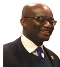
IMMEDIATE PAST PRESIDENT